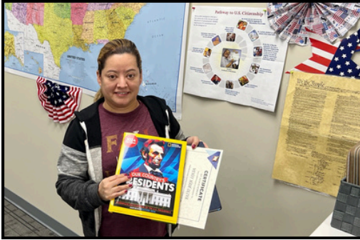
The Elks donated 20 copies of a book about US presidents to the PVLA's citizenship classes, one of which is held here by the first program graduates of 2025.